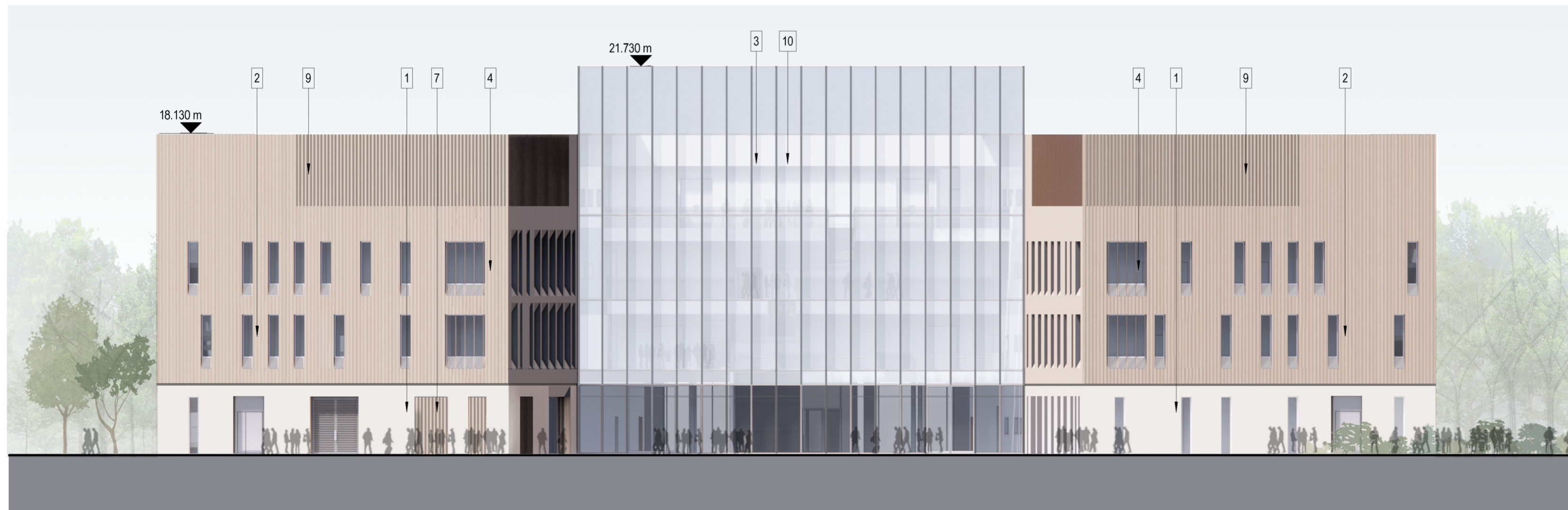
1 Planning GA West Elevation 1 : 200